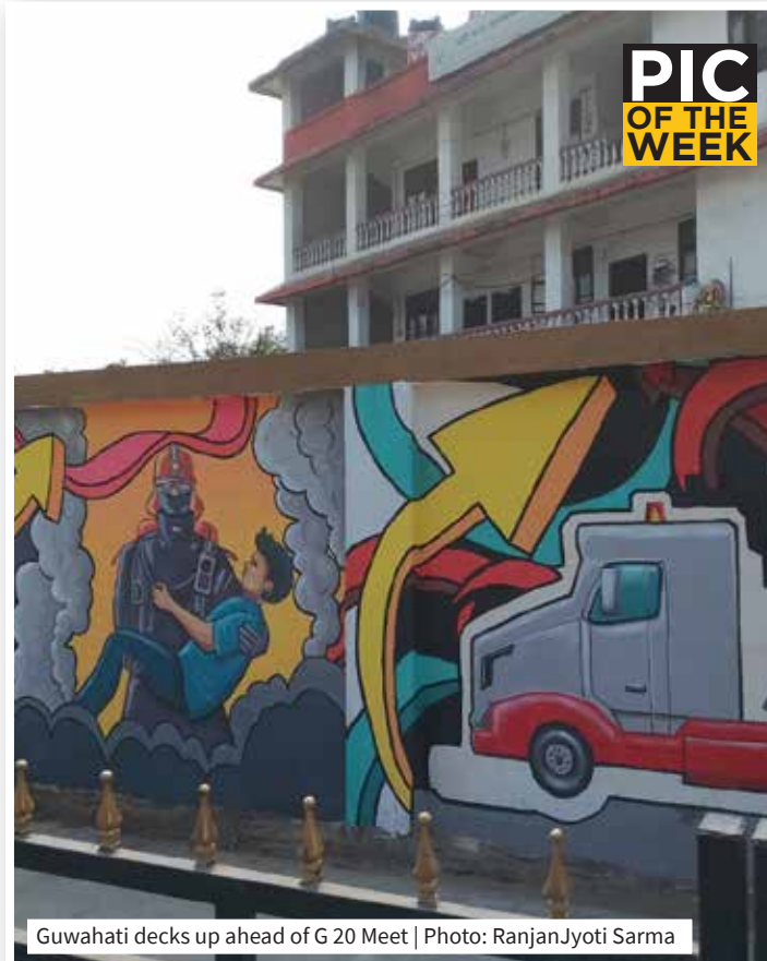
Guwahati decks up ahead of G 20 Meet