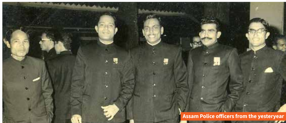
Assam Police officers from the yesteryear

My father, who had never been popular with the establishment, had a tough time finding a uniform that fit him when the order came to take charge. He needed the uniform to carry out his first order of business, which was to attend the funeral.