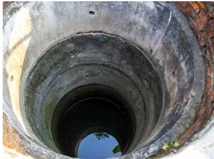
The ground water level has significantly dropped in Guwahati

At the beginning of 2022, Kamrup (Metro) administration seemed caught off guard by the decision on groundwater extraction in Guwahati. The administration initially banned all forms of groundwater extraction, but later revoked the ban quoting public requests. Meanwhile, for a few days, many residents of Guwahati were unable to purchase water as people selling underground water were scared because of the ban.