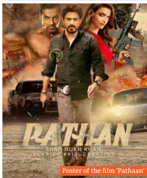
Poster of the film 'Pathaan'

It is always a treat to see the women in these genres of movies, put on the highest heels and