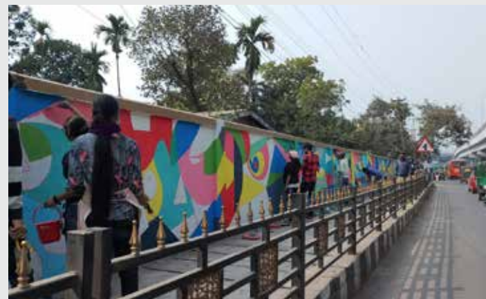
Guwahati is getting decked up ahead of G 20 Meet

The last time Guwahati saw beautification at such a large-scale was in 2019 when Former Japanese Prime Minister Shinzo Abe was set to visit the city to hold summit talks with Prime Minister Modi. The Fancy Bazaar ghats and parks were beautifully constructed and renovated and even a red carpet was laid out. However, the visit had to be called