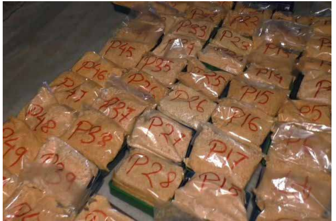
Heroin is being smuggled concealed in soap boxes

The substance is mostly found in white or brown powder form, or sometimes in a black sticky form