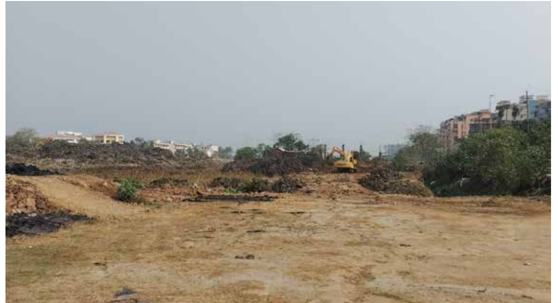
Assam Sahitya Sabha accuses GMDA of occupying the land owned by the body

"We are sad about GMDA's illegal and forceful work. I request the government to take action and prevent the 50 bighas of land given to the Asam Sahitya Sabha from being forcefully occupied by the GMDA. Otherwise, the central committee of the Asam Sahitya Sabha and the people of Assam