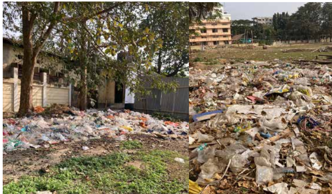
Multiple events held at Chandmari ground left the place in a dismal condition

The corners of the ground were seen covered in filth that was left behind after the structures of the fair were taken down. The administration hasn't cleared out